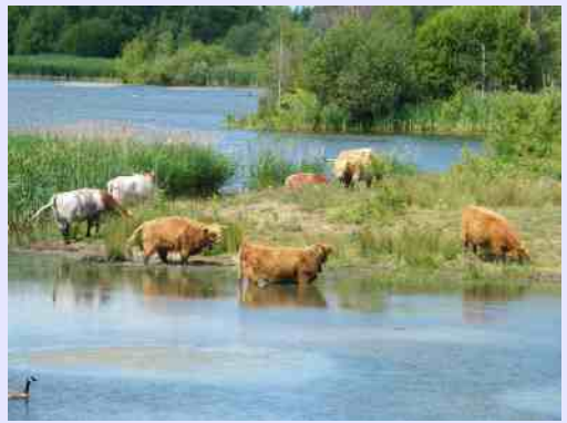
Willington Wetlands is a nature reserve located between the railway and the River Trent. It is home to beavers and lots of birdlife, plus these Highland cattle.