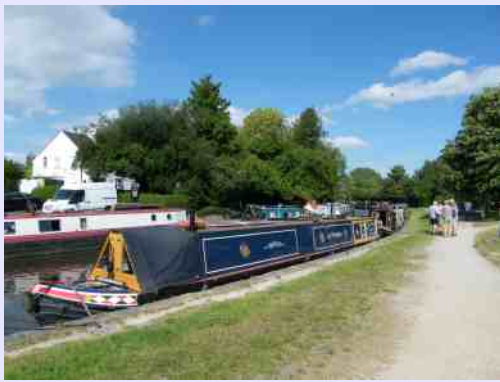
Single mooring required near the road bridge.