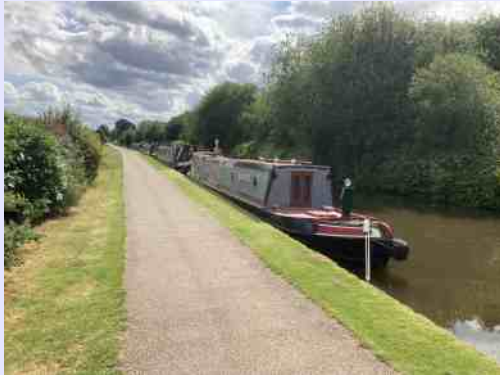
Four boats heading to the AGM weekend are seen moored at Shobnal Fields in Burton on Trent. But no sign of any of the crews!