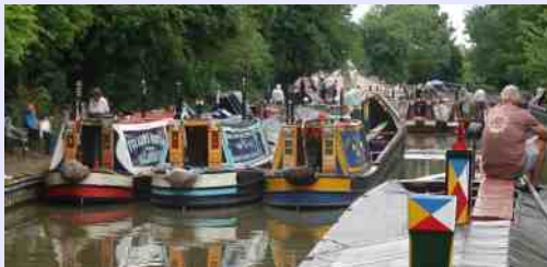
Best seen from the water: The mass gathering of former working narrowboats – up to five deep in places.