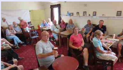
AGM attendees all paying attention! RNR Newsletter : Summer 2025

all the other facilities in the village. As Rally Organiser, I know it is a challenge to find suitable venues that offer mooring and facilities to meet our various needs. Willington, especially the Rising Sun, certainly exceeded all expectations. We will definitely return for another event there some time in the future.