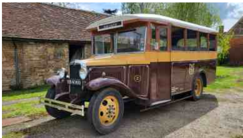
Jenks, the 1932 Bedford WLB bus with a Davies Body, once belonged to the fleet of Williams of Blaينا, South Wales