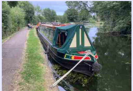
Brunel, Uranus and Antares then proceeded to the Erewash Canal, in convoy as far as Sandiacre Junction. A hot afternoon was spent watching carp and a grass snake in the canal.