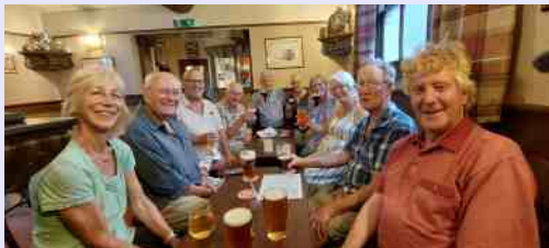
Unsurprisingly all the crews were in the Burton Bridge Inn! (Not the closest pub to the canal, but definitely worth the walk).