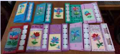
The stunning results of the craft workshop. [SW]