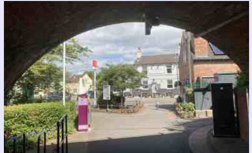
The Rising Sun from the station underpass. [AL]