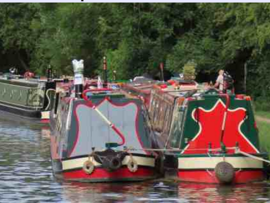
ing path side (right).