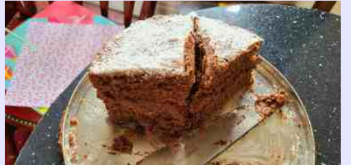
To keep the crafters nourished, Mick baked this fabulous chocolate cake. [JH]