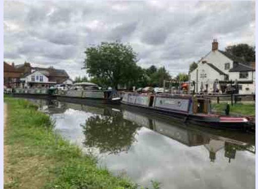
Three boats heading from the AGM weekend are moored at Shardlow, just yards from both the Malt Shovel and the New Inn.