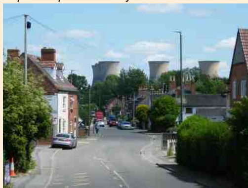
A soon to be historic view of Willington village, with the cooling towers of the now redundant power station in the background.