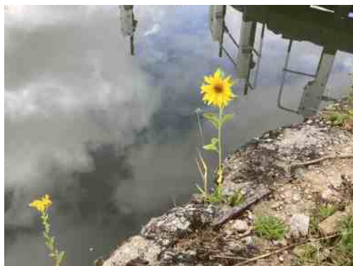
Appropriate lock side vegetation for the July heatwave - a sunflower on the Leicester line.