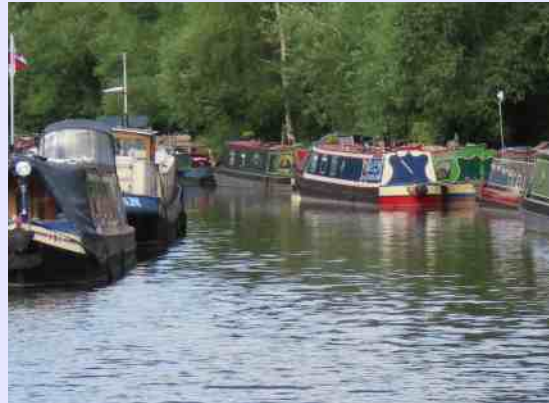
Attending RN boats moored two abreast on the tow