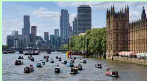
The FBW flotilla viewed from Westminster Bridge

Events were held on each route, including at Tooley's Historic Boatyard on the Oxford Canal in Banbury and at Lichfield Cruising Club. After a two-week delay caused by an unscheduled closure of the Boston Barrier for maintenance the Environment Agency, a flotilla of 14 narrowboats embarked on a 50-mile, nearly 12-hour journey across the Wash from Boston to Wisbech, including a break on Thief Sands to wait for the incoming tide. The Wash is not natural territory for narrowboats and the convoy made an unusual and